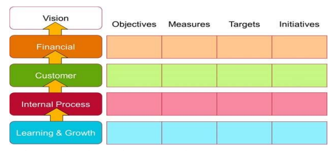
Figure 3. Classical Balanced Scorecard Perspective for Commercial Entities

strategy that is intended to occur when a company expands while simultaneously creating economic, environmental, and social value. Template The first generation of balanced scorecards is described as having only 4 perspectives that are used in implementation by companies. Here is an example in Figure 3 of the original or classic BSC: